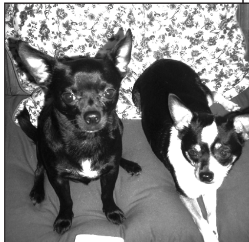
Gizzy, on the left, is all black except for a small white blaze on her chest. Killer, while mostly black, is tri-colored, with a fair amount of white and a small amount of brown.