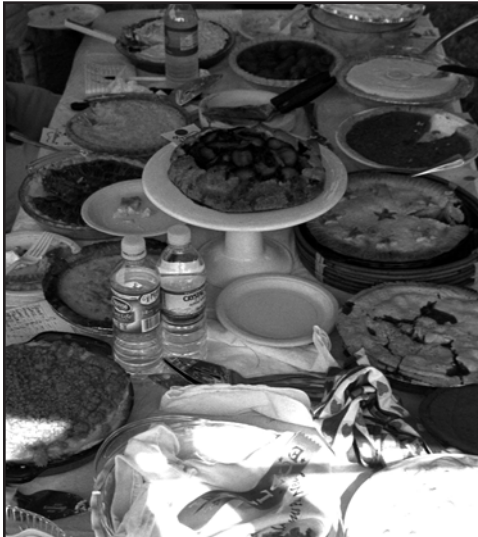
So many pies, so little capacity.