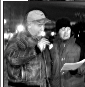
It was cold out, so nobody stayed very late. But it was a nice evening — a small example of peace and goodwill.

NOTE: The Smyrna Library Gallery is exhibiting "The American Family Quilt," a group of paintings that combine the format of quilts and the perceptions of families, now through April 30, 2009. Gallery hours are M-F 9 - 9, Sat. 9-6, Sun 1-6 and admission is free to the public. For more information, go to www.friendsofmysrnalibrary.org or call 770-431-2860.