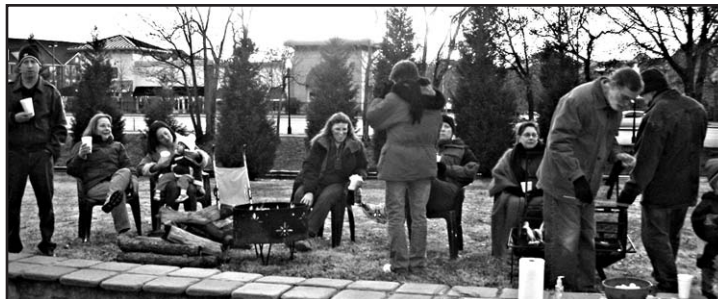
Neighbors gathered to roast hot dogs and marshmallows and drink hot cocoa.