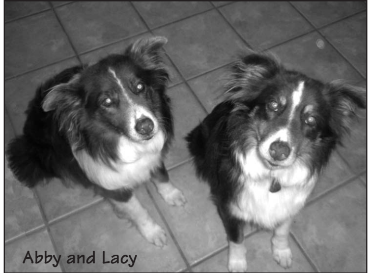
Abby and Lacy