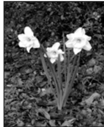
Fine daffodils, maybe — but they ain't no jonquils.