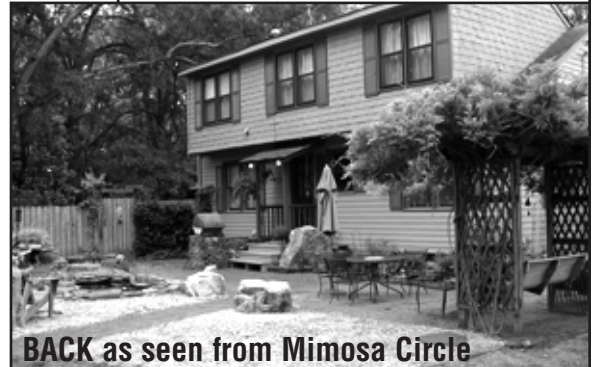
BACK as seen from Mimosa Circle

1320 Roswell Street were the first to break the mold repainting their Hatcher home a bold two tone green more appropriate to its styling than the bland beige it had been.