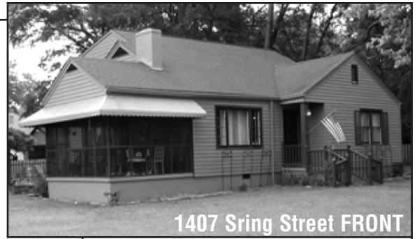
1407 Spring Street FRONT

Cindy Hannon has also done a great job choosing a new three color paint scheme for her home at 1338 Roswell Street. Again, the existing roof color, multiple tones of cool grey, integrates beautifully with the cool paint hues — a mid-tone grey violet, a navy blue (on the thalo side) and a mid-tone grey. Say "violet" and most people will cringe but here — this is a quite color just daring enough, but certainly not over the top colorful. This house is one of the first group of Hatcher craftsman revival houses built in the neighborhood around 2002. Though he got better as he gained experience, these houses carried mostly timid colors with too much similarity from one house to the next. Myrna and Larry Evans at