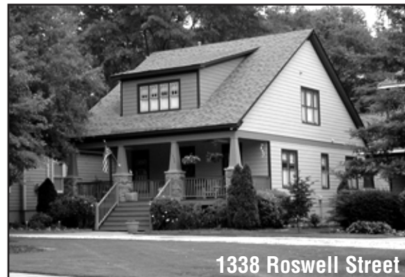
1338 Roswell Street

Such carefully selected, highly personal color schemes are a real benefit to the neighborhood. Aside from simply looking good, they convey the feeling that these homes are really loved by the people who live in them.