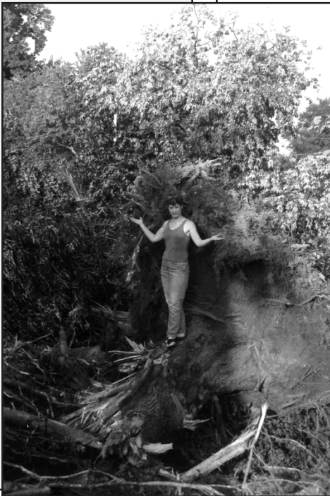
That's me standing on the upturned roots of one of Williams Park's big old trees. I'm wondering, why don't we do a better job protecting these valuable assets?